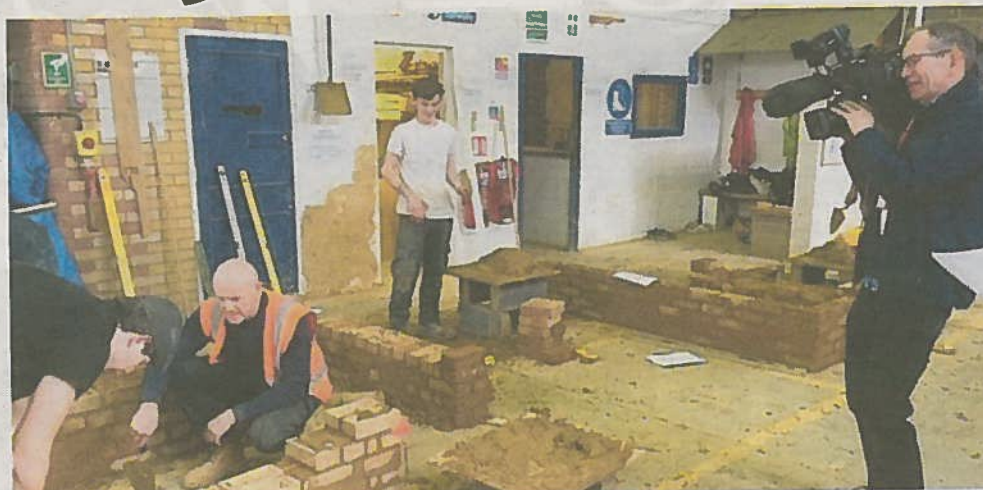
BUILDING SKILLS: Brickwork in the construction department

Visitors will also have the opportunity to look around the