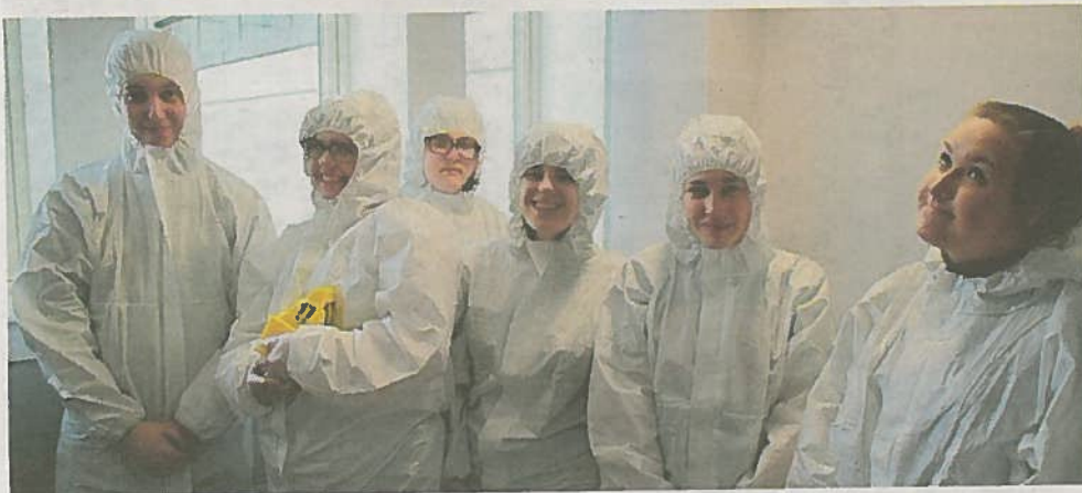
ON THE SCENE: Applied science students ready for CSI

People interested in hair and beauty courses are invited to the Lee Stafford Academy at 15-21 Rainsford Road on Thursday, October 6 from 10am to 4pm to see what the courses are all about and the hospitality and catering department will also be open for tours and tasters at the same time at the Princes Road campus.