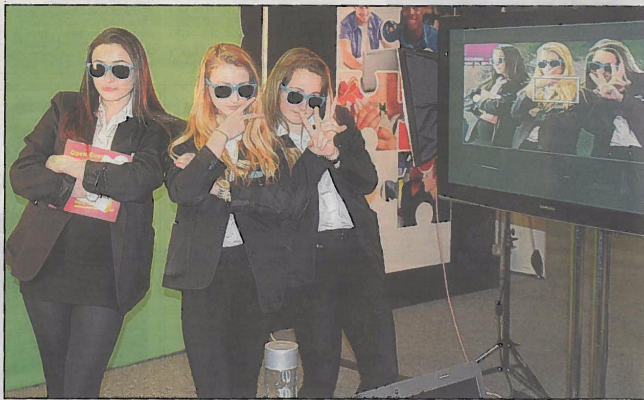
SUNNY PROSPECTS: These students got a chance to read the weather using the green screen technology used on the television

The Art and Media department at Chelmsford College offers dynamic and challenging courses across a range of media working